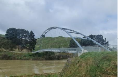
Cycle & walk bridge,