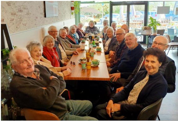
Photo: The Coffee Club, sussing out Roots Café – one of the new places in Town.