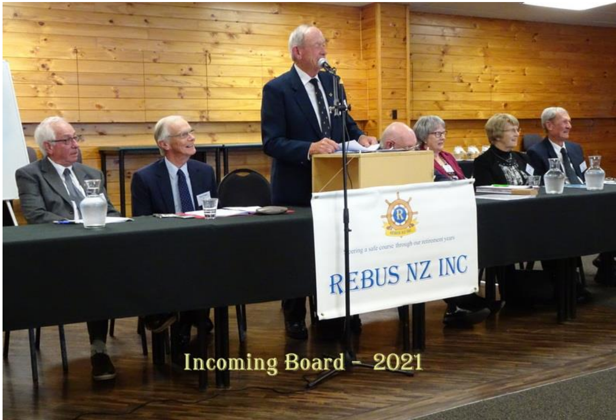
Incoming Board – 2021