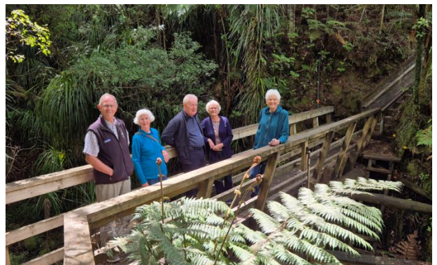
Photo: of some of our group standing on the model dam, a short distance from the Centre.

Recently we visited the Visitor Centre in the Kauaeranga Valley , Thames. An interesting movie in their small cinema showed the logging days of the giant kauris. Large dams were built to flush the logs down the river to the booms at Parawai . Hundreds of these logs were shipped to San Francisco to rebuild the City after the catastrophic 1906 fires. Life was unbelievably tough in those days. We don't realise how lucky we are to have lived in our generation.